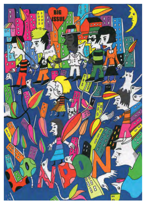
'London' by Chris Bird - you can see more of Chris's work in his online gallery at: outsidein.org.uk

We also work closely with and support Voicing Views , the mental health service user voice in Wandsworth. Contact details for Voicing Views can be found on our website under 'Get Involved'.